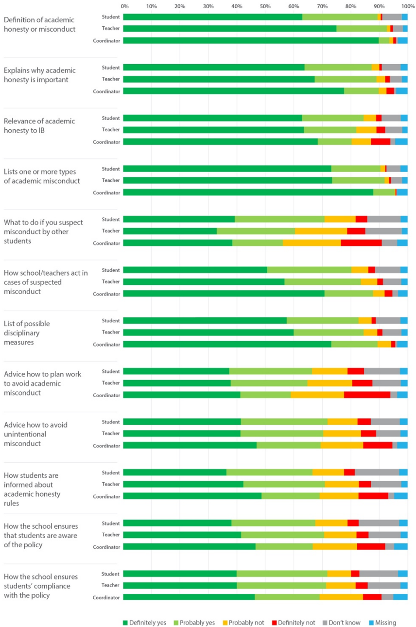
Figure 2: What is in your school's academic honesty policy? Comparison of Responses