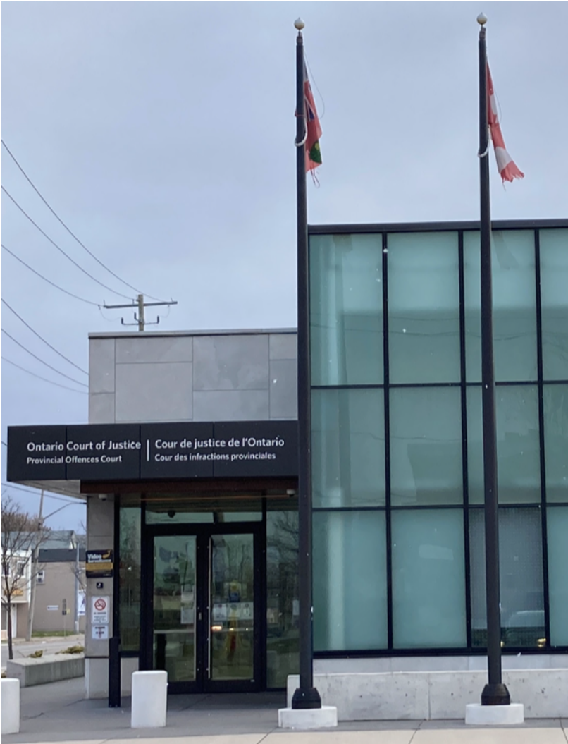
Image 2. An Ontarian courthouse

I spent one week driving around Ontario to these communities, these islands in an anglophone sea- islands that I never knew existed. Some were cities with multiple intersections and abundant gas stations and stores, while others were villages with a singular gas station and general store. Once arrived in a supposedly French-speaking place, I inspected every business's signage I drove past. All were in English, in every town. Only courthouses' and post offices' signs --government buildings—used both French and English (see Image 2). This finding added to my skepticism of the presence of French speakers here.