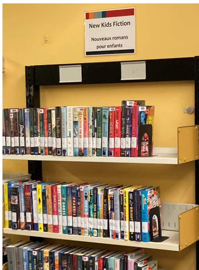
Image 3. French-language Materials at a public library