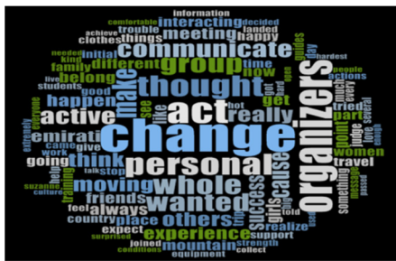
Figure 1 indicates by size the most frequently expressed words in the interviews. Figure 2 suggested four distinct (but not necessarily disjointed) themes in the source documents, listed here in increasing order of word frequency:

Figures 1 and 2 show the word frequency cloud and corresponding dendrogram of the most commonly occurring items in the analysis.