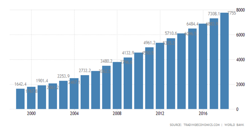
Figure 2: The Gross Domestic Product Per Capita in China (U.S. Dollars, 2000 to 2020) (https://tradingeconomics.com/china/gdp-per-capita)

economy, forecasting that China will face economic crisis, if not in one already (see e.g., Pesek, 2019; Rapoza, 2019; Schuman, 2019). In spite of such negative views toward Chinese economic growth and the heightened uncertainty regarding a trade war with the United States, the Chinese economy still grew over 6% in 2019 (Reuters, 2019). China's economy also performed well in 2020, after effectively managing the COVID-19 pandemic. Whoever argues for the imminent bust of the Chinese economy thinks against the bigger trend of Asia as a whole returning to the historical norm of leading world economic growth (Mahbubani, 2018). The Chinese economy may not be able to grow at 10% annually in the future, but the large scope as a world's second largest economy today makes each small percentage increase a large increase in absolute terms.