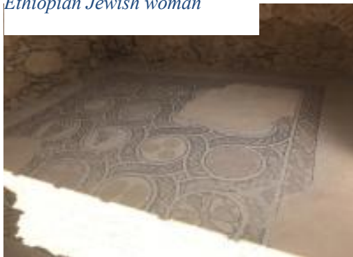
Byzantine synagogue mosaic floor in Ein Gedi