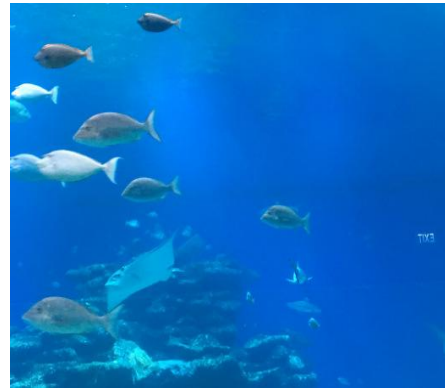
View of fish and coral in underwater observatory in Eilat, Israel