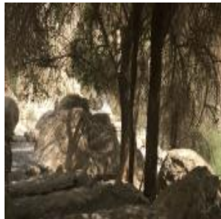
Oasis of Ein Gedi