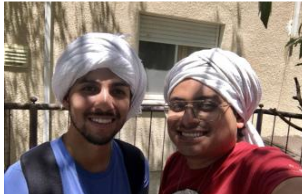
Ethiopian Jewish turbans on teachers/participants