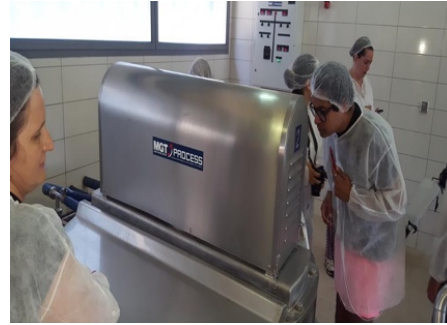
Buza Ice Cream Store