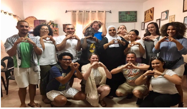
Fulbright-Hays group with peace activist at your home