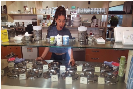
Teacher in Buza ice cream store