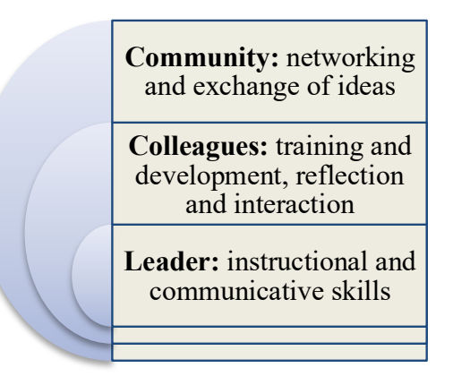
Figure 3: Leadership development process in Nepali context

As represented in Figure 3, a preliminary requirement for leadership development is continuous learning attitude in prospective leaders which is also reflected in better communication skills and instructional competence that provides visibility among colleagues and the community. All the research participants are intrinsically motivated to learn. For example, participants two and three as outstanding performers in different levels have untiring learning attitudes and passion for knowledge which has made it possible to diligently take numerous degrees and engage in diverse training and seminars.