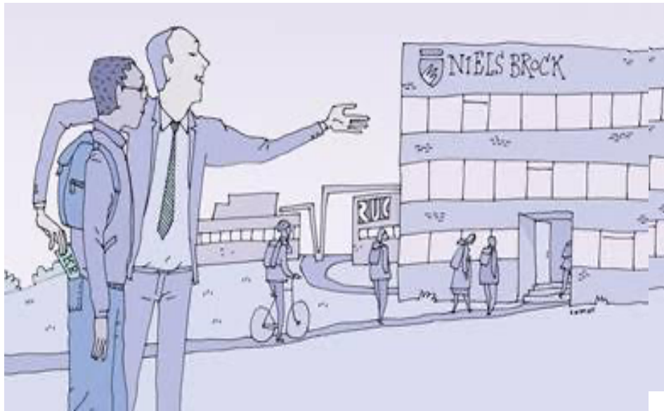
Figure 2: RU paper

One third of international students at RU are Nepalese students who hold at least a Bachelor's degree from Niels Brock. Nepalese people have most often been appointed by agents who earn a lot of money from providing international students to Niels Brock, an institution which offers non-Danish accredited international education. The students must struggle hard to get an education in the West. We have met, among other things, a Nepalese student and her husband who work full time to scrape money together for the studies. Many others struggle with the special Danish study form at RU and the academic English level. At the same time, poorly paid jobs fill up so much of their time that they have difficulty following their studies (RU Paper is an independent newspaper of Roskilde University).